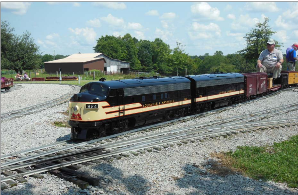
Below: Grosser's 1:8 scale layout.