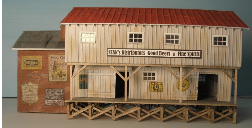
Left is one of Rich Murphy's structures. Right is a Microscale graffiti set.

Decals are available from suppliers, such as microscale.com, for lettering, intermodal, railroad, vehicles, graffiti and weathering.