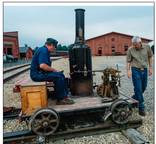
Above is a photo of a steam powered speeder. How is that for combining steam and vehicles in one photo?